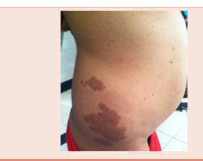
Figure 1: multiple cafe-au-lait spots over the trunk and limbs.

Modified supraglottic laryngectomy, included the resection of epiglottis, aryepiglottic folds and incomplete false vocal folds resection was indicated because the tumor infiltrating the larynx was